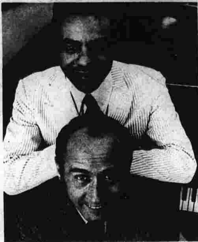
Singer Johnny Mathis, top, and Henry Mancini are on CBS' "The Ed Sullivan Show" Sunday 8-9 p.m.