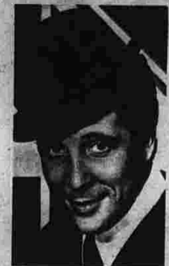
Singer Tom Jones in "This is Tom Jones" Thursday 7:30-8:30 p.m. on ABC.