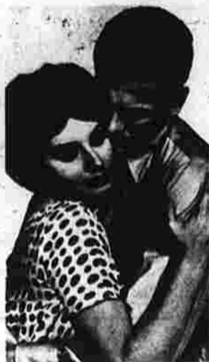
Sophia Loren and Tab Hunter in the movie, "That Kind of Woman," 9-11 p.m. on ABC Sunday.