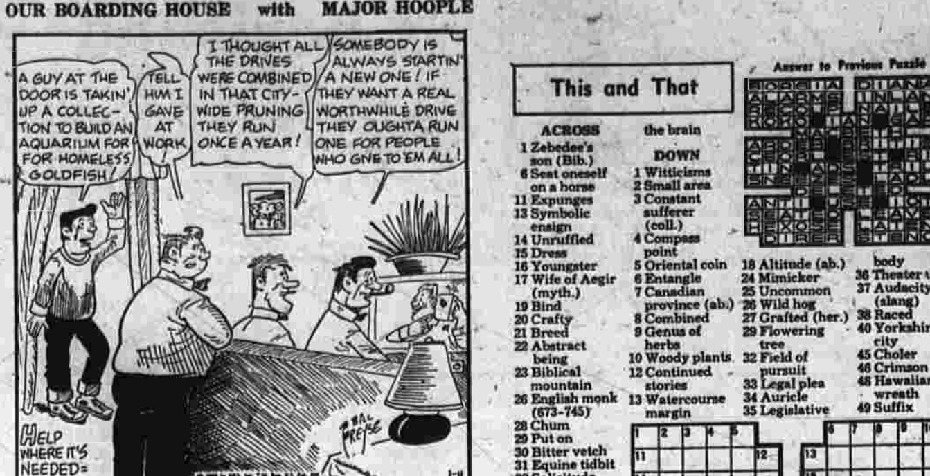
OUR BOARDING HOUSE with MAJOR HOOPLE