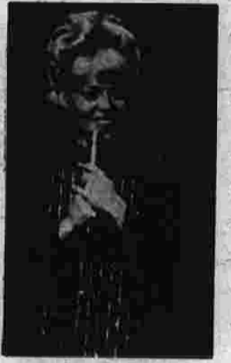
Jaye P. Morgan in NBC's "The Outsider," Wednesday 10-11 p.m.