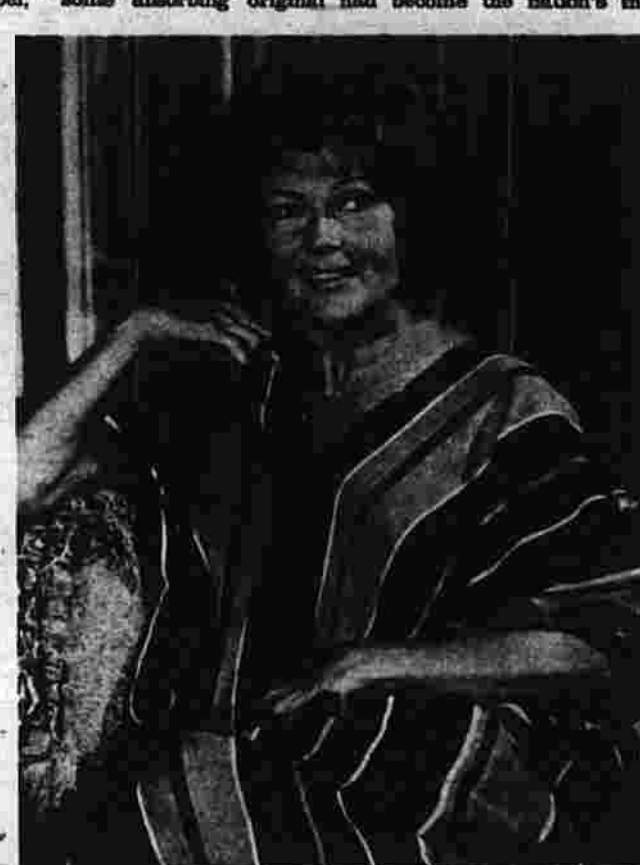
Rita Hayworth, once a movie queen, talks of her life at 50 on NBC's "First Tuesday," Tuesday at 9.